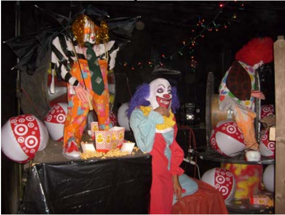
Why do clowns scare so many people?

D.A.R.E. / G.R.E.A.T. Haunted House October 22 nd , 23 rd , 29 th , and 30 th , 2010 City Hall