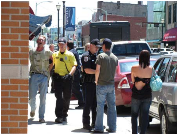
Officers make an arrest after a disturbance downtown