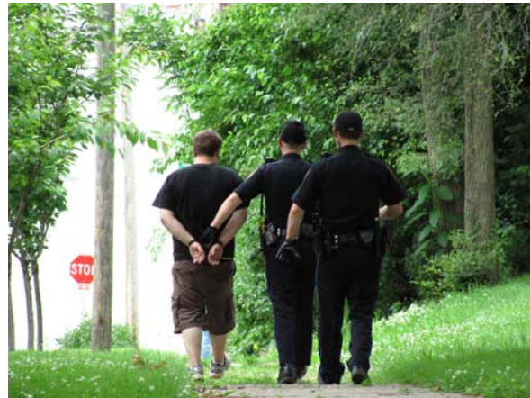
Just one of the 3,925 arrests during 2010