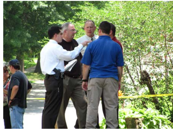
Investigators updating the Chief after gang shooting