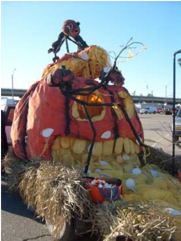
The award winning DARE/GREAT float designed and constructed by Lynn Diveley, and was used as a way to draw attention to the upcoming haunted house!