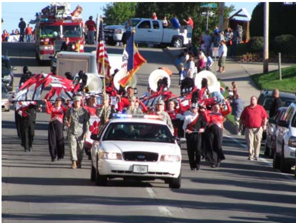
Leading the high school Homecoming parade