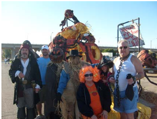
Some of the volunteers who were on the float.