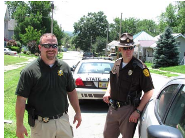
Wapello County Sheriff's Department and Iowa State Patrol always ready to assist