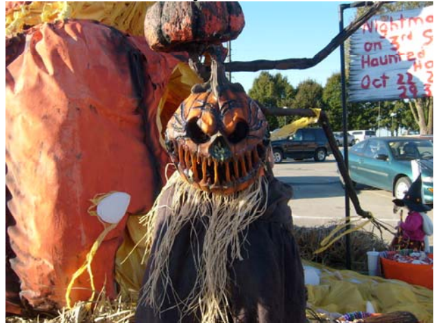
Pumpkins were the theme of this year's float.