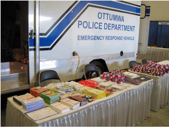
Our booth before the Home Show started! This was our third year participating in the event.

Home Expo Show March 5, 6, and 7, 2010 Bridgeview Event Center